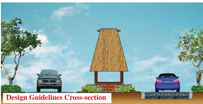
Design Guidelines Cross-section

Mike Sharrocks managed the preparation of this 2005 Master Plan and supervised the review and changes for the following Master Plans in 2006 and 2007. In addition, he also outlined the content of subsequent Design Guidelines and managed the preparation of them. These guidelines would set the design standards for public realm areas (principally roads, footpaths and landscape treatment) throughout the 640-hectare area of the resort.