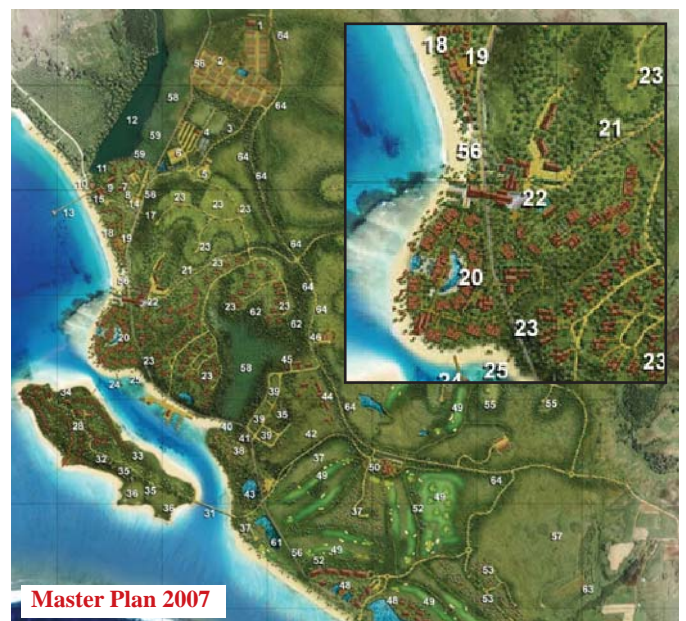
Master Plan 2007

Tourism Feasibility • Development Planning • Urban Design • Urban Regeneration • Environmental Appraisal