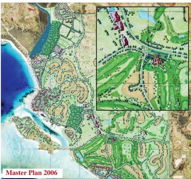
Master Plan 2006